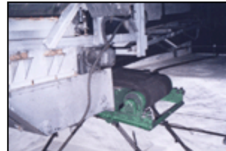
RCY-Q Light-duty Self-cleaning Permanent Magnetic Separators